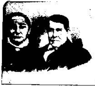
Johann and Caroline Riedesel - nee Knebel